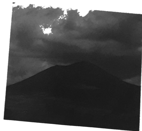
▲ Mount Vesuvius

A roaring avalanche of poisonous gas, ash and rock, travelling at a speed of 100 kph, thundered down the mountain covering everything in its path. Pompeii was buried.