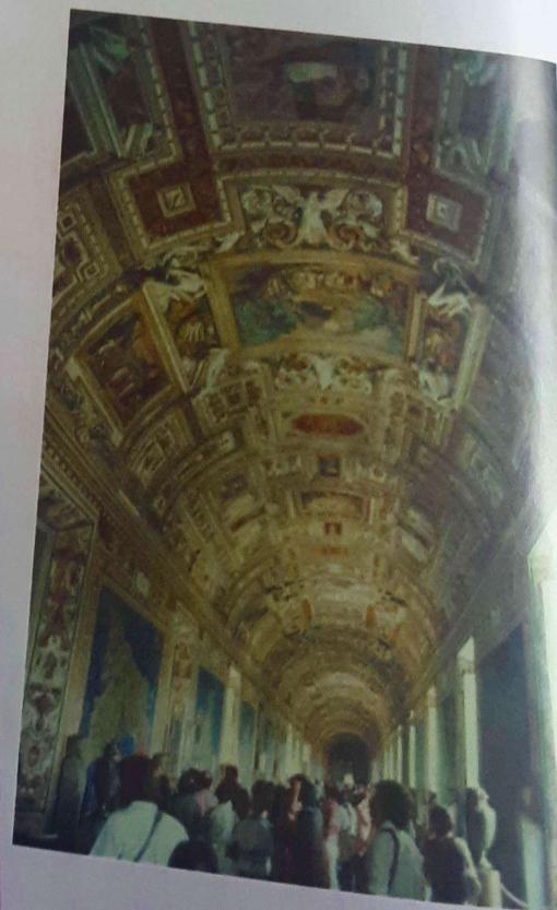
▲ The Sistine Chapel

The explorers Christopher Columbus, Marco Polo and Amerigo Vespucci (after whom America is named) are all Italian.