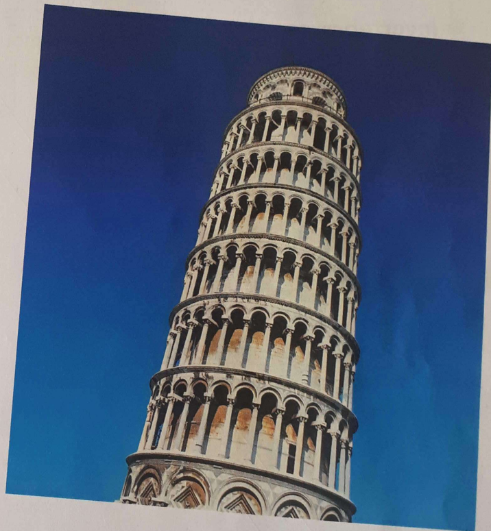
▲ The Leaning Tower of Pisa

Italy is the world's biggest exporter of wine.