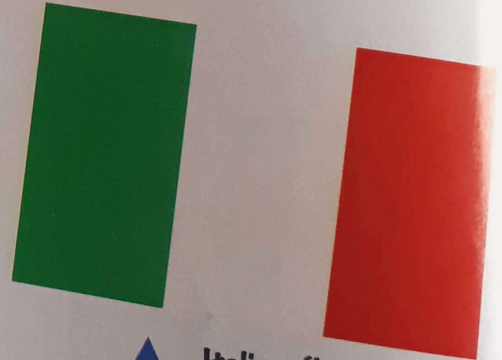
▲ Italian flag

The city of Venice is built on water. Instead of roads there are canals and people travel by boat instead of car! There are unusual boats called gondolas. They are all painted black because of a law passed in 1562 to stop people from wasting money on paint!